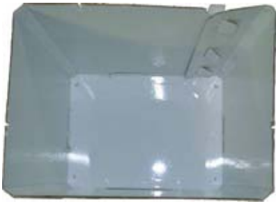
↑ Top view of the lower graph (not included).

2 .Attach the board to form a cube and place it on the metallic base, once done, put the first shelf and on each side attach a transparent support for the shelf.