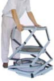
Twister Calera Ref: 10.784